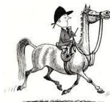
A SMART TURNOUT IS OF FIRST IMPORTANCE.

Champion Show Hunter - Winners from classes 19 - 29