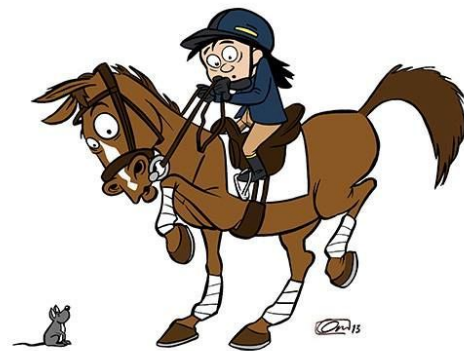
HOW TO TEACH "PASSAGE"